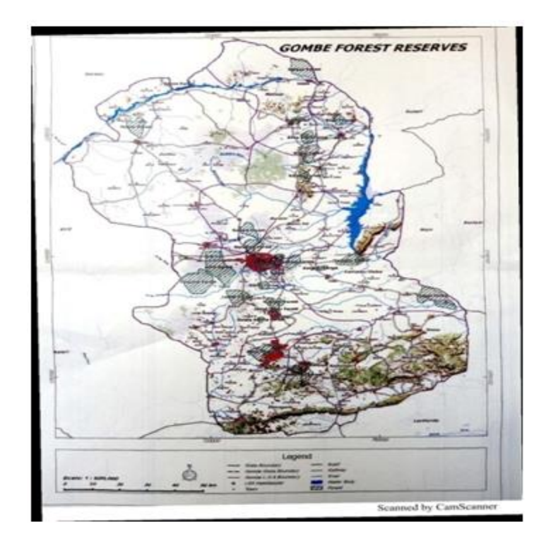
Fig. 2: Gombe Forest Reserves and Areas of Coverage.

3.1 The materials used for the study include, the hand held Global Positioning System (GPS) receiver to take the coordinates in terms of latitudes and longitudes of the source areas. A digital camera was used to take the photographs of the vegetation cover, the felled trees, loaded trucks, piled up lots and the cleared farmlands. The ranging poles and measuring wheels were used to establish the quadrants of the areas in order to identify the predominant trees felled for fuel wood. A quadrant measuring 50 square meters was taken at 10 sample plots in each of the identified fuel wood sources to determine the number of individual species. Hassan, Scholes, and Ash (2005). opined that 100, 50 and 25 square metres quadrants can be used in vegetation studies of woodland trees and shrubs. Other equipment used include Prismatic compasses for measuring