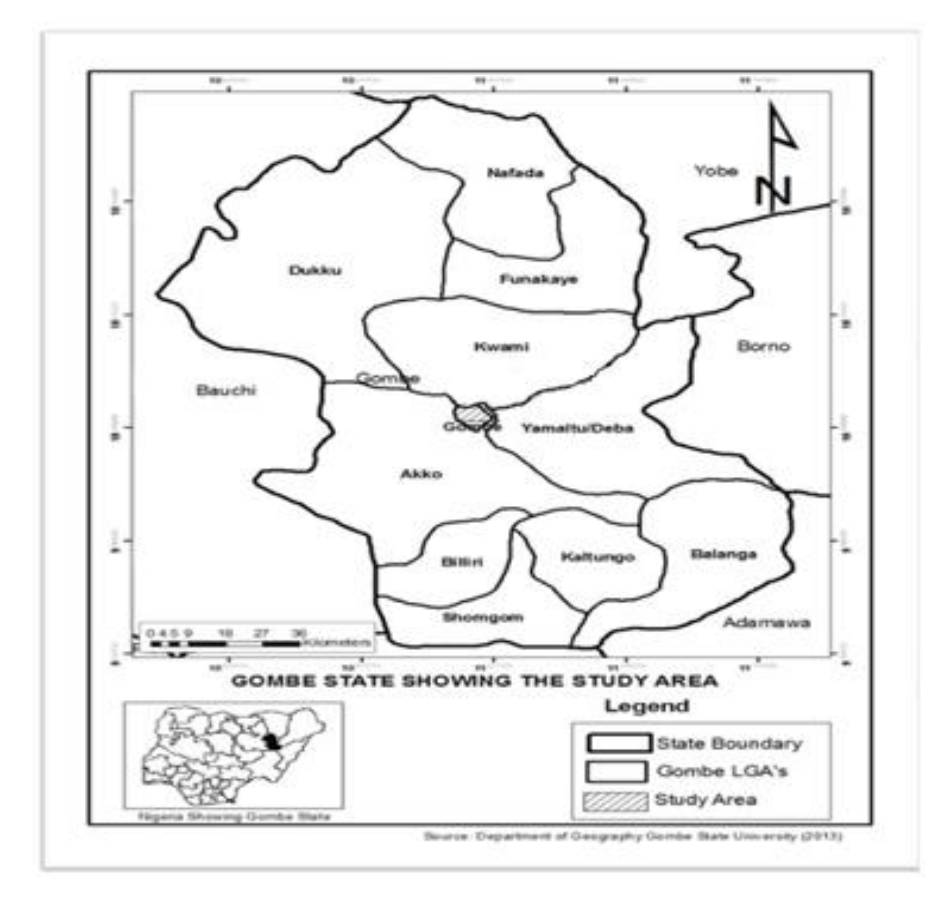
Figure 1: The Study Area (Gombe State)