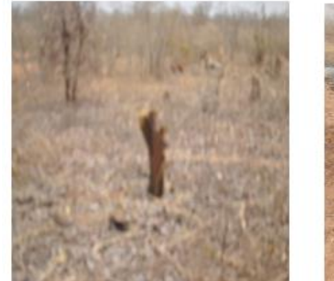
Plate 4: Half Cut tree

In terms of areal coverage changes expressed in square kilometers, Figure 6 depicts the changes over the ten year period (2006 -2016). Wawa Forest reserve takes the lead in the depletion in terms of size and faster movement away from the localities in its close vicinity before. They needed to trek a long distance to fetch the firewood, take their animals to far distance for fodder, the animals which they used to tame from closer points, now no more. In addition to that, as expressed by them in the interviews and focus group discussions conducted with them, they notice a lot of changes in terms of well water, soil erosion, flooding etc.